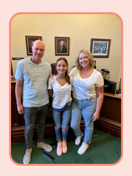
This summer we have celebrated 5 kiddo's adoptions with another 5 pending before the end of the year.