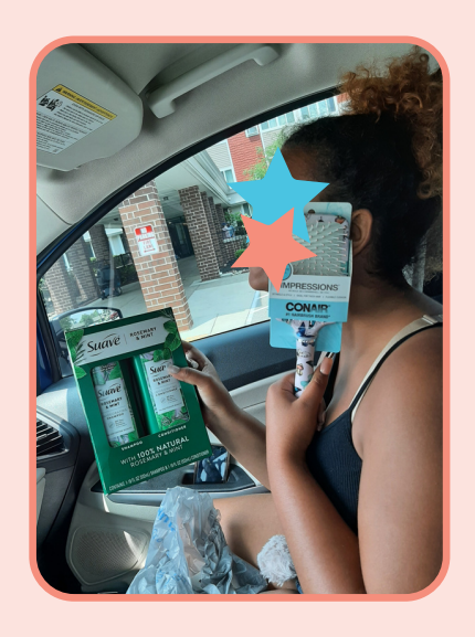
Donations allowed for us to take 15 independent living youth shopping for ethnic hair care needs!