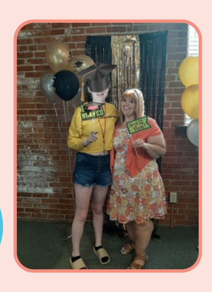
In May we had 7 youth graduate from High School. Your donations provided them gift cards to celebrate!